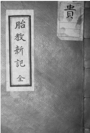
figure 1. Taegyo singi

womb will become a good person someday. Kweon (1972) was the first researcher of Taegyo singi, and published a commentary in Korean on the book's preface and postscript. Follow-up studies were made by Park, (1985), You, (1990), Jung, (2000), Ahn, (2005), Jang, (2005), and Lee, (2007), using various perspectives. But this research was not enough to effectively introduce traditional Taegyo singi into modern practice. Many people consider Taegyo practice as simple superstition, and unsuitable in modern times. The truth is that Taegyo singi is empirically based and grounded in philosophy (Chang, 2005; Ha, 1989; Lee, 2007; Yeo, 2005),